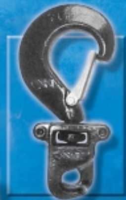
3303WLP Upper Shipyards Hook

Made in the USA for the ship building and metals fabrication industries.