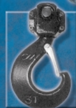
3403WLP Lower Shipyards Hook

For Construction and Industrial Applications • Capacities ¾, 1, 1½, 2, 3 Tons